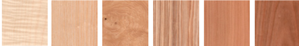
Sycamore Ash Burr Ash Olive Ash Cedar Cherry