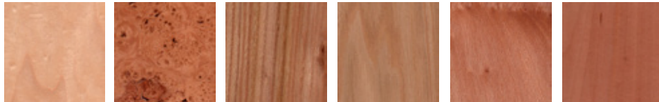
Maple Burr Maple Elm Chestnut London Plane Pear